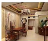
Building materials industry